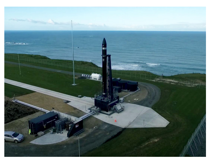
O ELECTRON AT ROCKET LAB LAUNCH COMPLEX 1 | Māhia Peninsula, 2017

Rocket Lab is a privately funded company with top tier investors including Khosla Ventures, DCVC (Data Collective), Bessemer Venture Partners, Lockheed Martin and Promus Ventures.