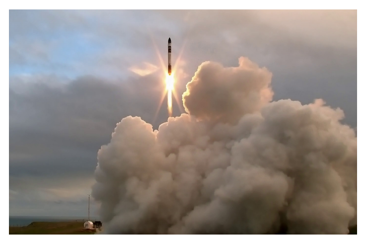
O LIFT OFF | Electron, 'ITS A TEST' launch, Māhia Peninsula, May 2017

Following the completion of a successful test launch, video and press materials will also be distributed to the media.