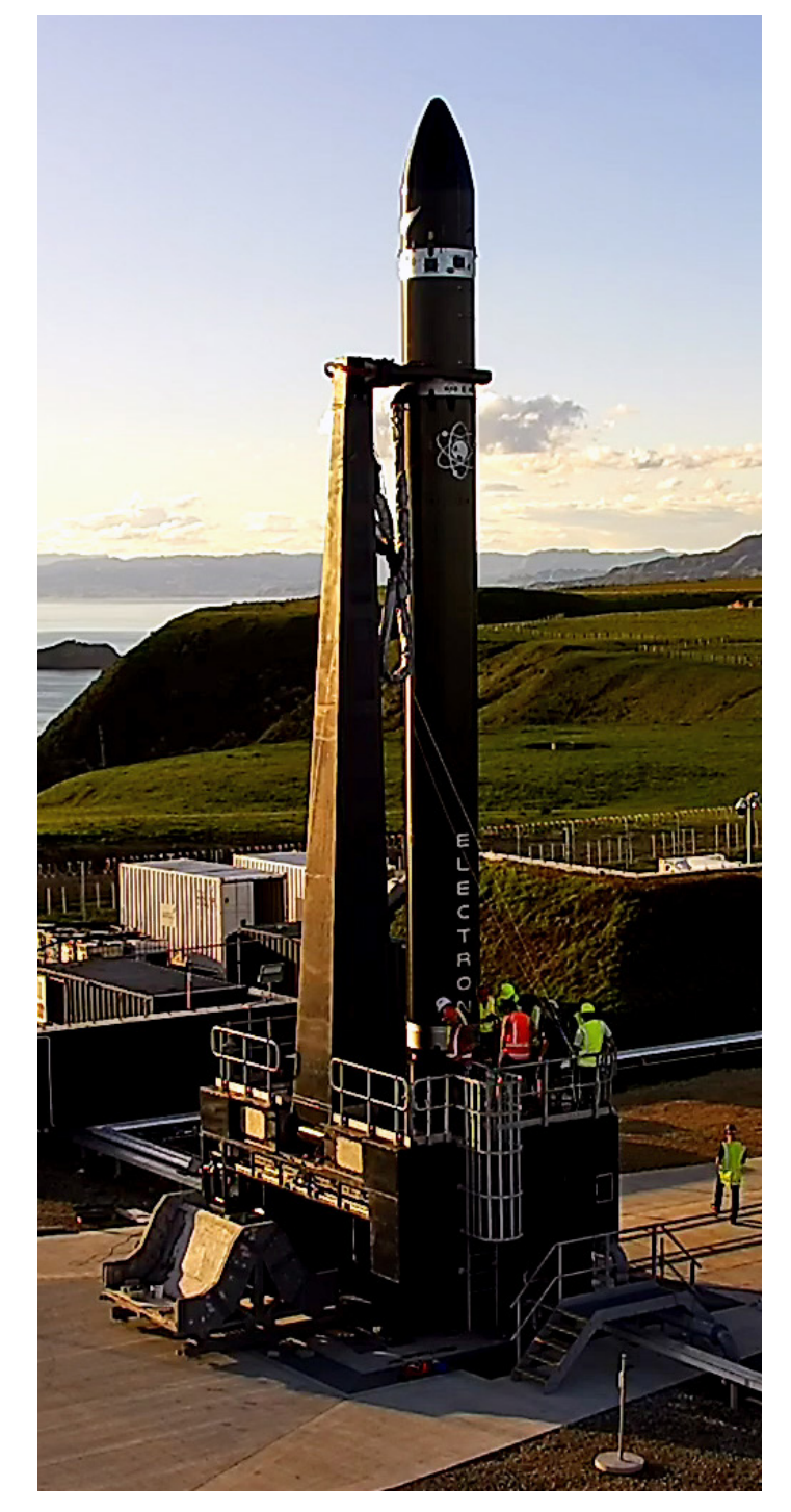
• ELECTRON STANDING TALL | Māhia Peninsula, 2017

Rocket Lab will be releasing video and images to media soon as possible following a successful launch.